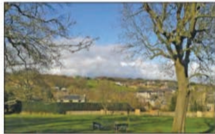
Park Local Plan.

All three documents are available on our website's Neighbourhood Plan page alongside comprehensive response tables outlining how all consultation feedback has been considered